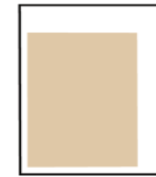
Jumbo Junior 7.867" x 9.375" (199.8mm x 238.1mm)